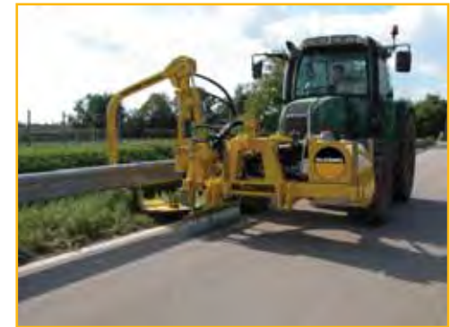
» Cuts Around Barriers