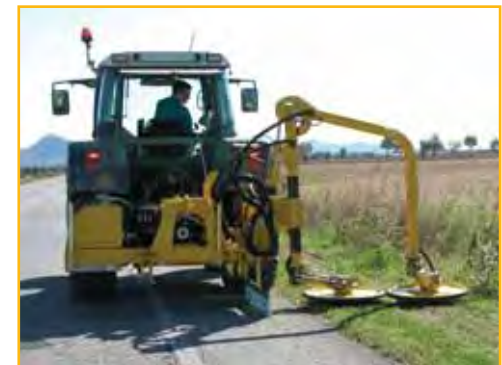
» Fine Cut Finish