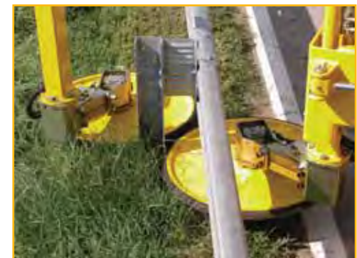
» Highway Maintenance