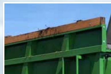
Side wall extension, 300 mm for compost or other light materials.