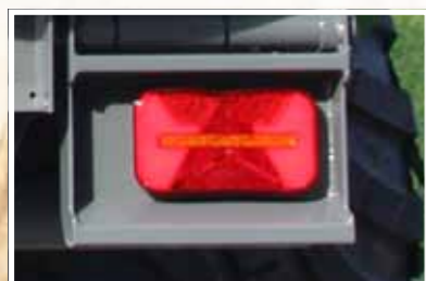
Suspended LED-rear lights .