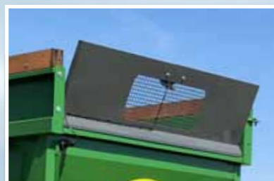
Protective grille at the front, transparent front wall and folding ladder on right when facing in the direction of travel. Wooden fork-cleaning strip.