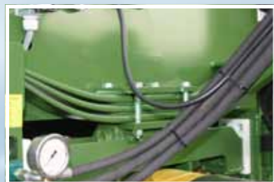
Drawbar , mechanical suspension with upper/lower drawbar.