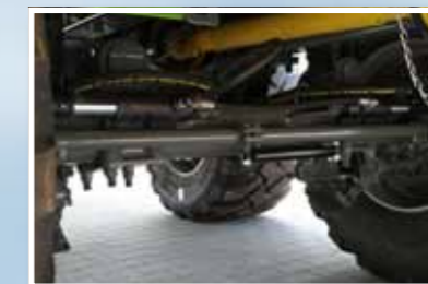
Self-steering axle has hydraulic locking system, with automatic alignment for optimum directional stability.