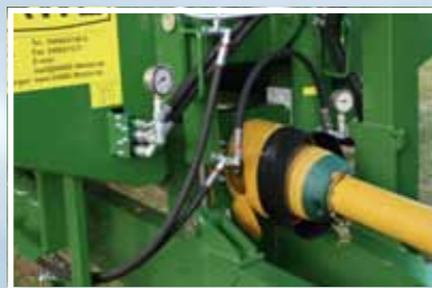
Drawbar , hydraulic suspension with lower drawbar.