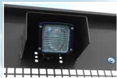
On request, LED work lights available inside and behind.