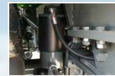
Running gear with hydraulic suspension , incl. lift axle.