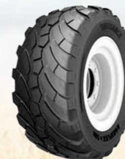
Alliance AGRIFLEX + 389 VF