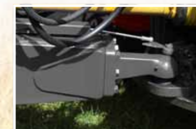
The positive steering system is controlled by a Bowden cable.