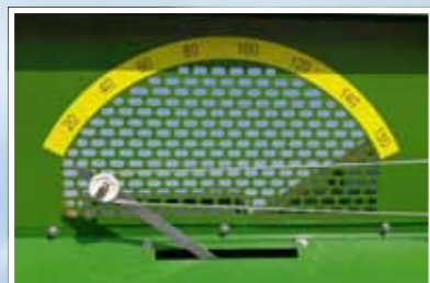
Indicator for regulating gate height, transparent side wall at front with a view through to the rotors.