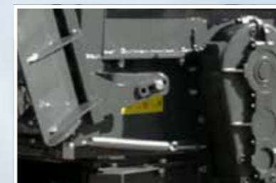
The cathodic dip primer is free of heavy metals. The KTL penetrates into even the smallest cavities. This means that all components are evenly coated.