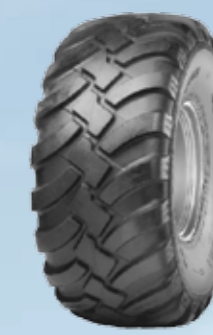
BKT FL 630 Super