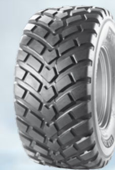
BKT RIDEMAX FL 693 M

Large-volume tyres reduce the tractive power requirement and prevent soil compaction even under wet conditions. The relatively large contact area minimises rolling resistance so the tyres keep rolling even under difficult conditions.