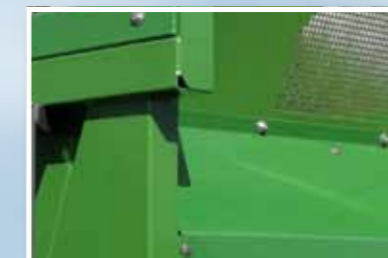
At the powder coating , the applied powder is baked in the oven at 190° C and fused by the action of heat to a resistant layer.