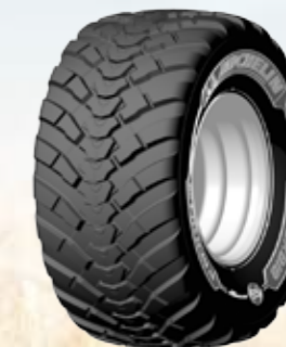
Michelin TRAILXBIB High Flotation