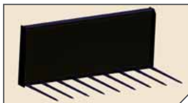
Utility Manure Fork Forged tines Ø 35x860 mm