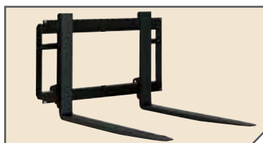
Pallet Forks Height 780 mm