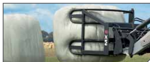
Manubal 200 Fixed left arm Mobile right hand with three adjustable position 3 rd function required Power equivalent or more than U6