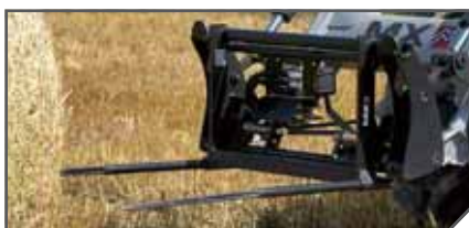
BR 15 Forged tines Ø 35x1200 mm, 850 mm between centres (MX hitch only)