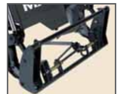
MX implement carrier