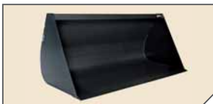
Utility Bucket Wear plate, 150x16 mm